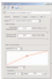
← Comprehensive camera control